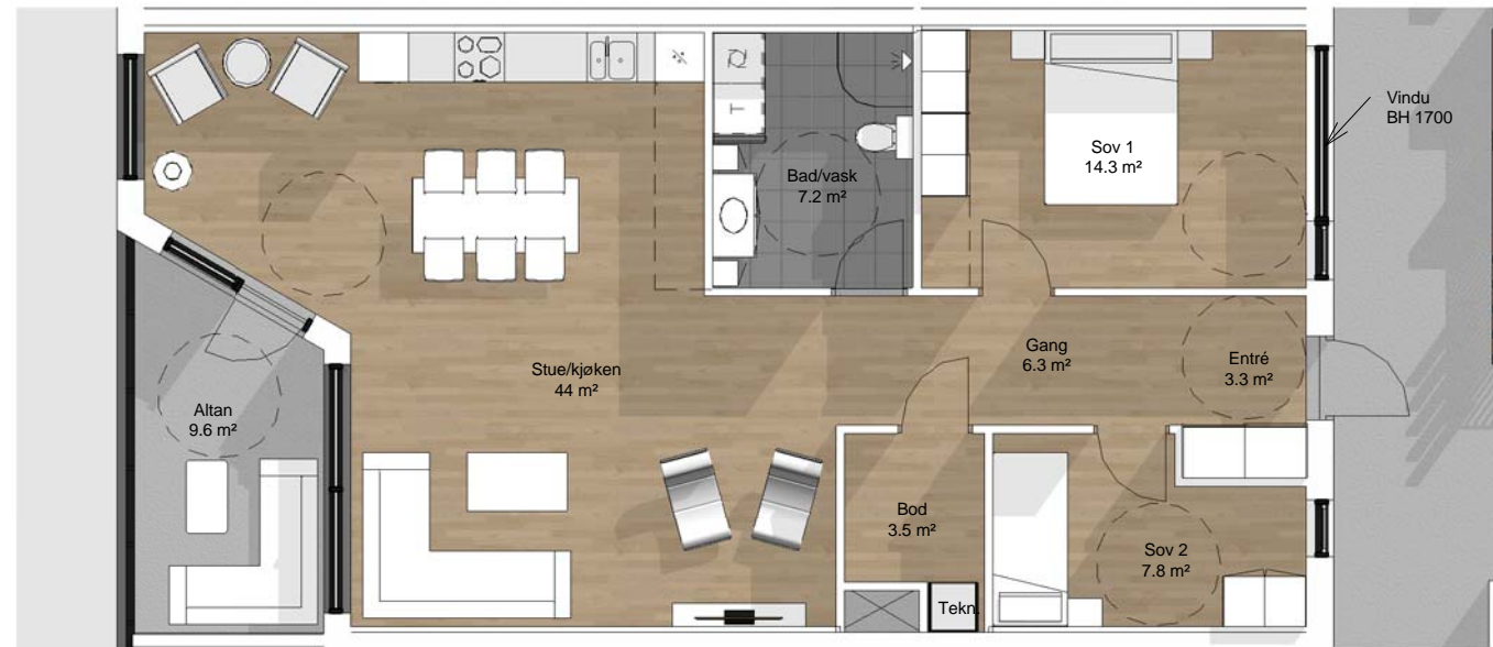
L Type B2 1.-3.etg 1 : 100